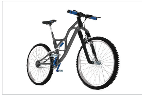
Bike with optimized frame