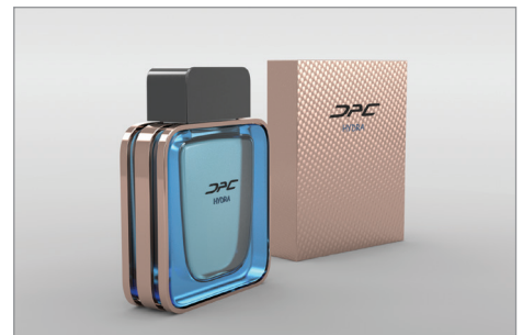
Perfume bottle concept