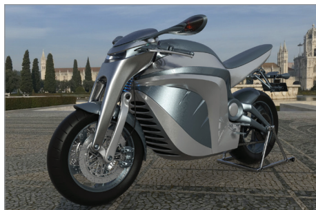
Electric motorbike concept