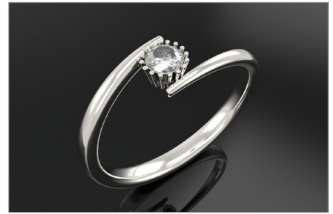
Diamond ring rendering

greatest flexibility and precision. NURBS are capable of representing any desired shape, both analytic and free form, and their algorithms are extremely fast and stable. Full NURBS-based modeling, construction history, and the most advanced modeling tools make Evolve a matchless tool for designers.