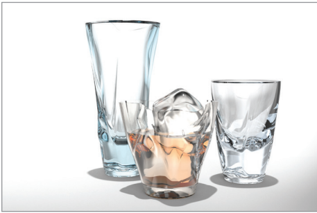
Set of glasses modeled and rendered in Evolve