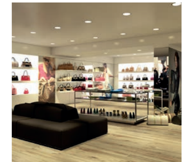
Shops and Showrooms

The tour can be enriched adding product sheets that can be connected also to an e-shop for online purchases. The online interactive visit has a profound impact on customers, encouraging them in their purchases in a more convincing way.