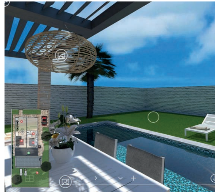
> Virtual Tour created with panoramic render with 360° view