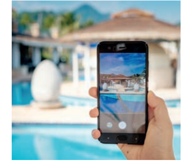
Tourism and Catering