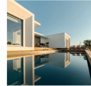
Architecture and Interior design