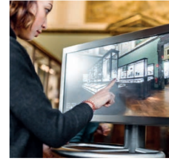
Art and Culture