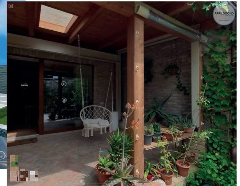
> Virtual Tour created with 360 camera